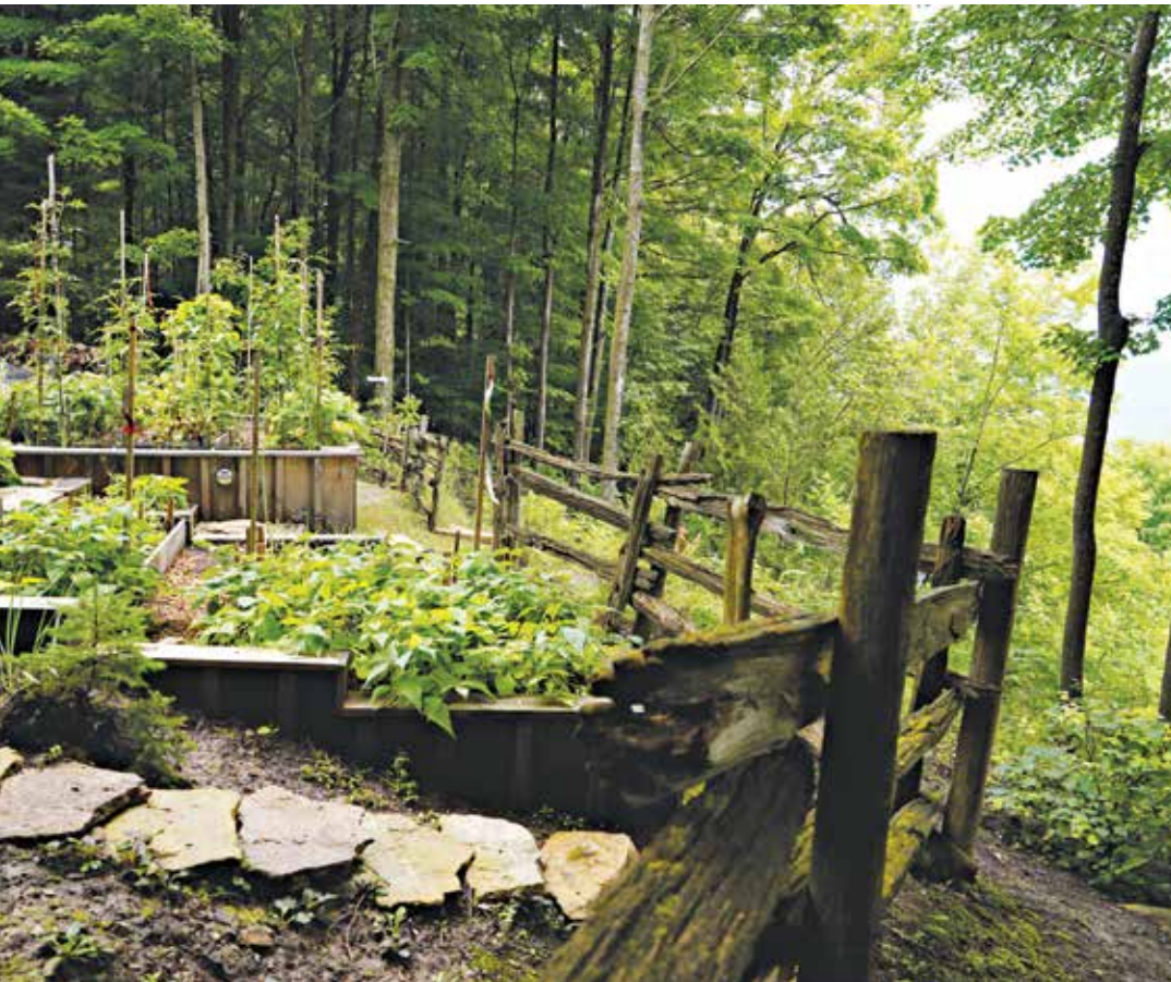
◀ Side view of the vegetable garden. Raised beds keep the soil level even though the slope is steep.