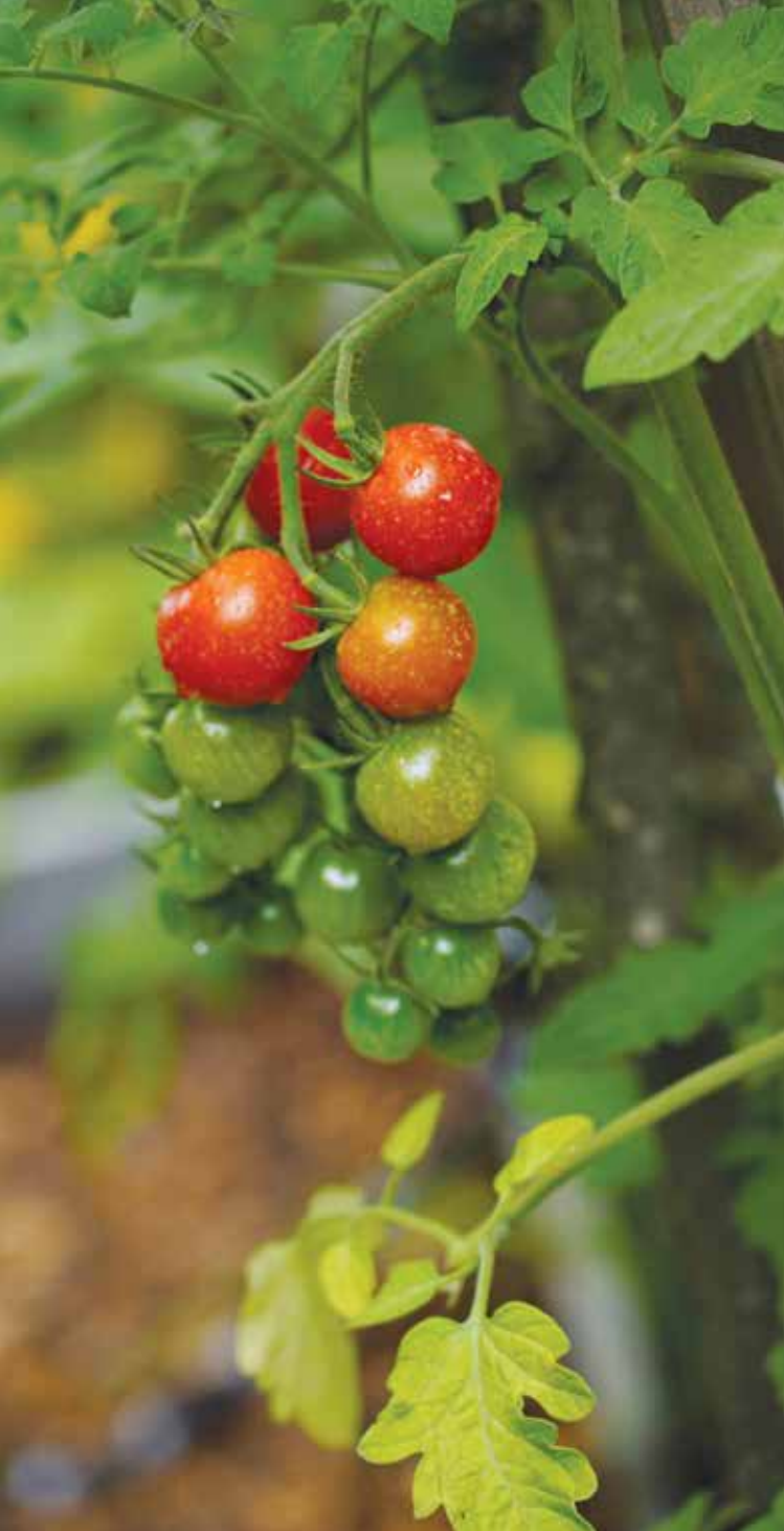
▲ Cherry tomatoes ripening on the vine.

Last year's crops, which are seen in the photographs of the whole patch, are purple, yellow, green and scarlet runner beans, indeterminate tomatoes from cherry to larger types, two types of eggplant, carrots, onions, radishes and beets, plus several kinds of peppers.