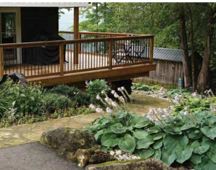
▲ Lilla looks after the pockets of flower beds that surround the house and property.